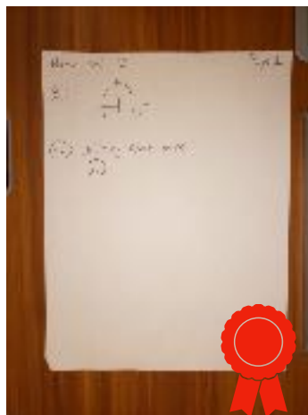
GOOD POSITION, WRITING IS LEGIBLE, SINGLE PAGE IN FRAME